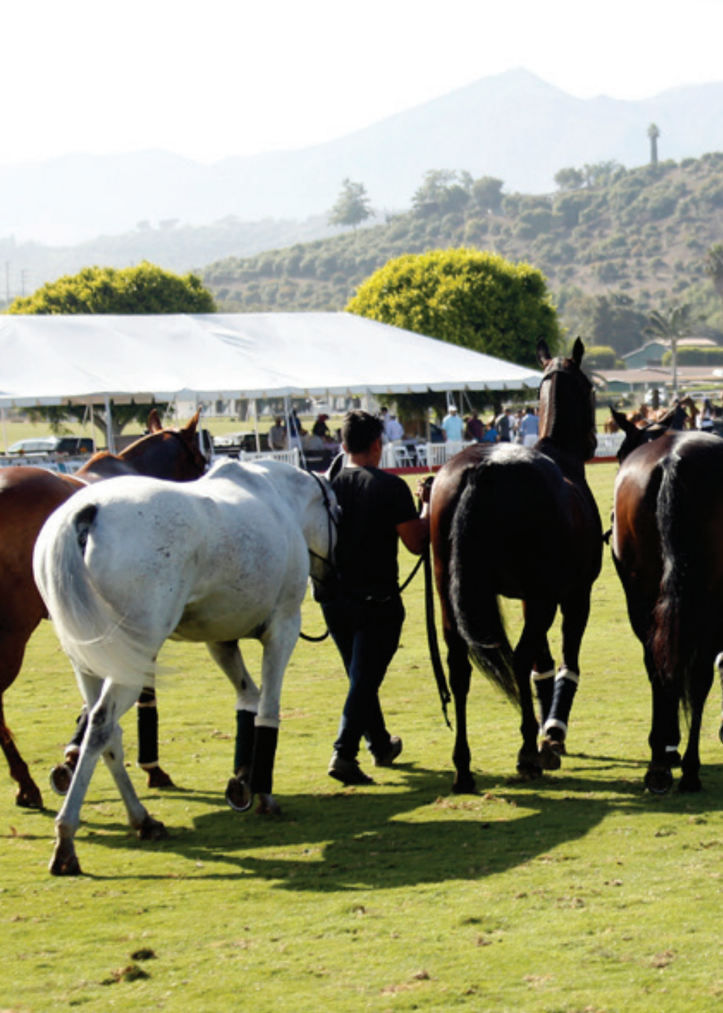
A polo pony's favorite home for the summer